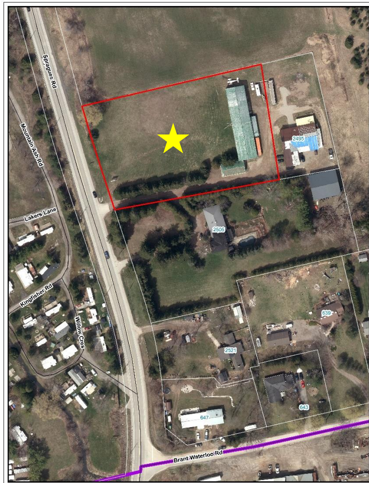
Figure 1: Location of Property

The property contains a storage business known as Just Store It . Surrounding land uses are primarily residential and agricultural. The property is serviced by a private septic system and a shared well with the adjacent property to the south (2505 Spragues Road).