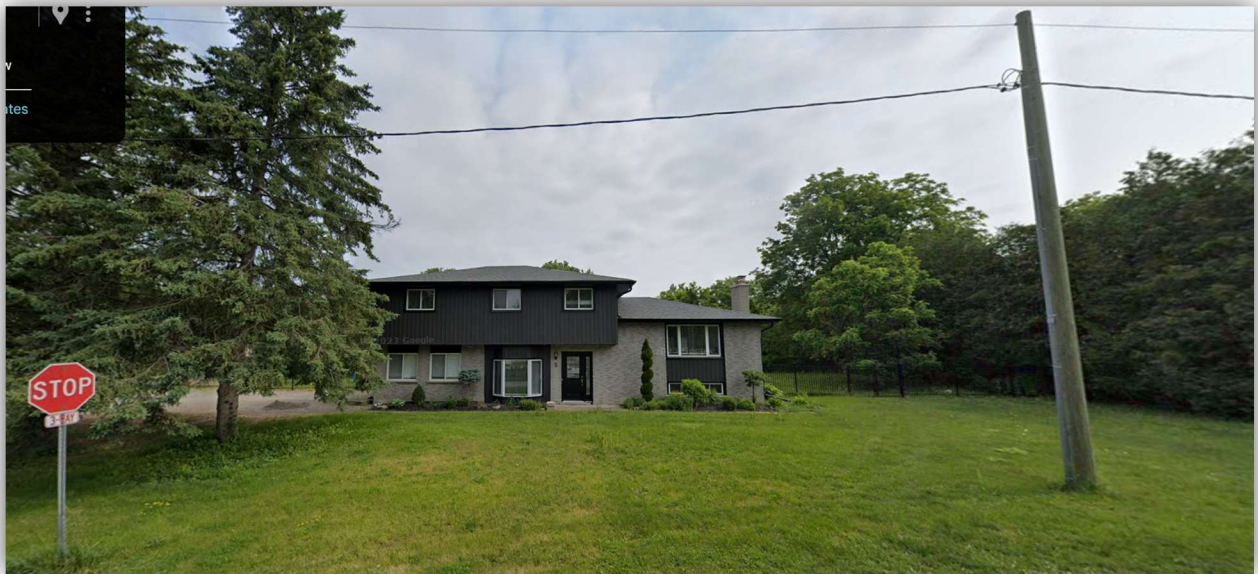
Figure 3: Existing Residence

The property is in the rural settlement area known as Branchton. It is designated as Zone 3 in the official plan for North Dumfries.