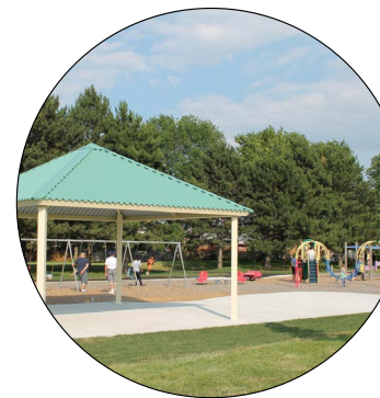
SEATING AREA WITH PAVILION