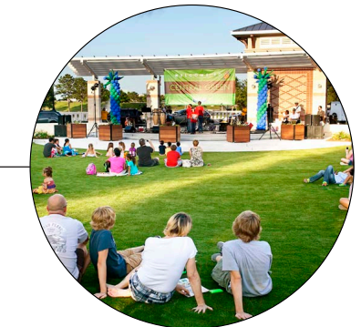
OPEN LAWN SPACE (EVENT/FESTIVAL SPACE)

PROPOSED PATHWAYS THROUGHOUT PARK SPACE, BENCHES FOR ADDITIONAL SEATING