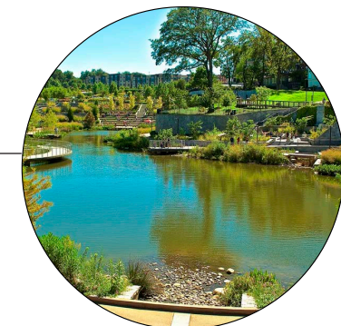
STORMWATER MANAGEMENT POND FOREBAY