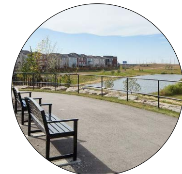
SEATING NODE OVERLOOKING STORMWATER POND