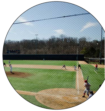
SOFT BALL BASEBALL DIAMOND