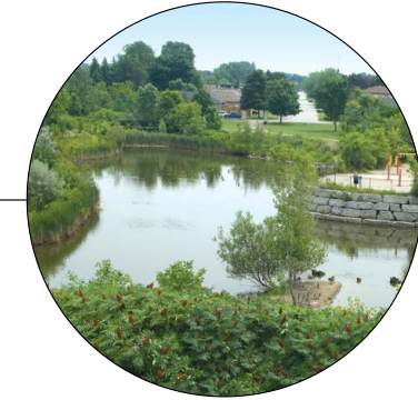
STORMWATER MANAGEMENT POND