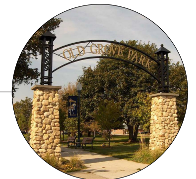
PARK ENTRANCE (PRIMARY)