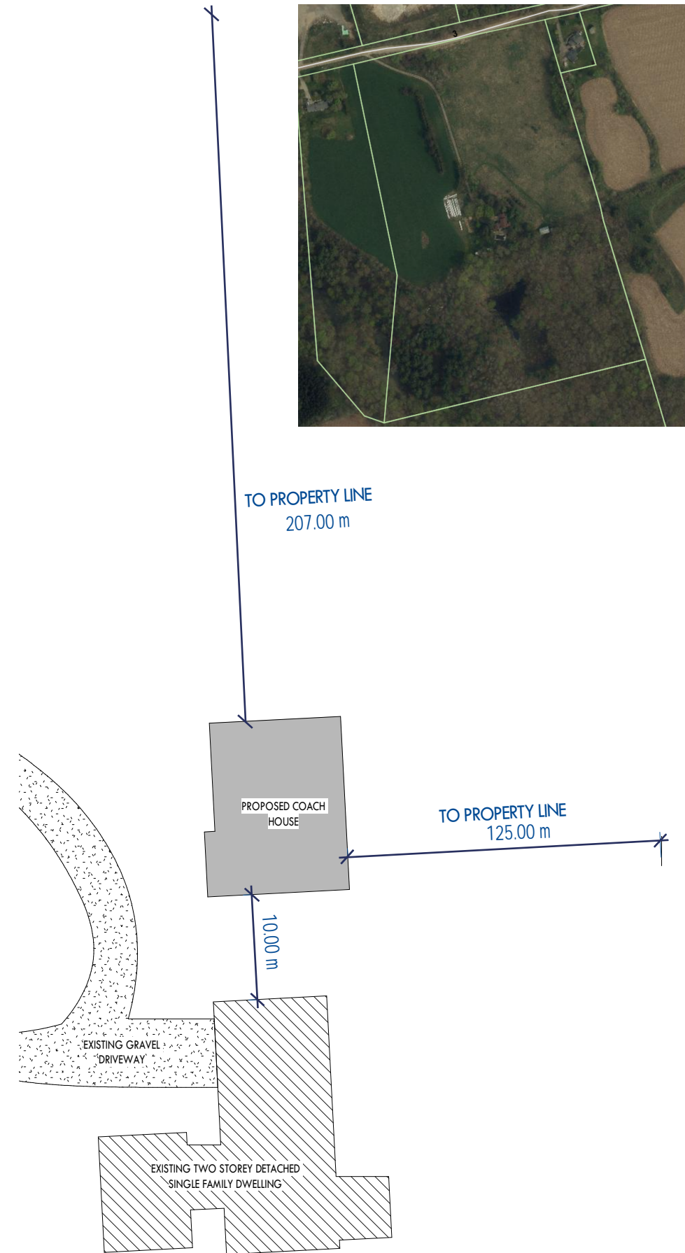
2 COACH HOUSE SETBACK IDC1.1 1/32" = 1'-0"